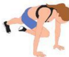
2) MOUNTAIN CLIMBERS