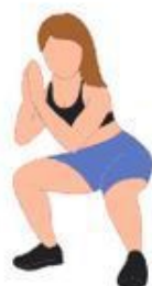
3) JUMP SQUATS