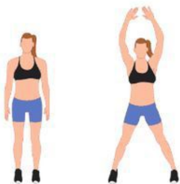
1) JUMPING JACKS

ADVANCED: 45 sec. exercise - 15 sec. pause